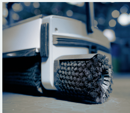
Exceptional brush pressure, up to 0.25kg/cm 2

Specifications and details are subject to change without prior notice.