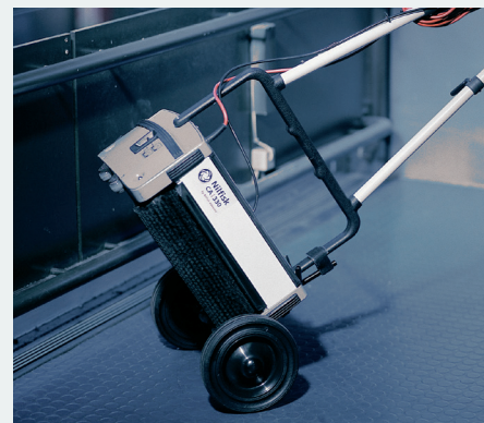
Options include tank to increase capacity and trolley for easy transport